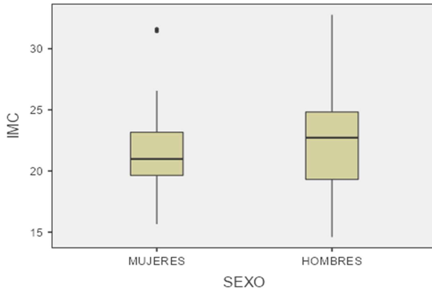
Diagram 1. Nutritional status with respect to the sex of young people from the Community of San Juan del Cantón Tisaleo.

The diagram shows the distribution of nutritional status according to BMI, of young people in the Community of San Juan del Cantón Tisaleo, according to sex. 66.66% correspond to women while 33.33% to men. The results indicate that the percentage of obesity is relatively low, with only 3.33% of adolescents classified as obese. Most adolescents (63.33%) are within the normal weight range, while 23.33% are underweight and 10% overweight.